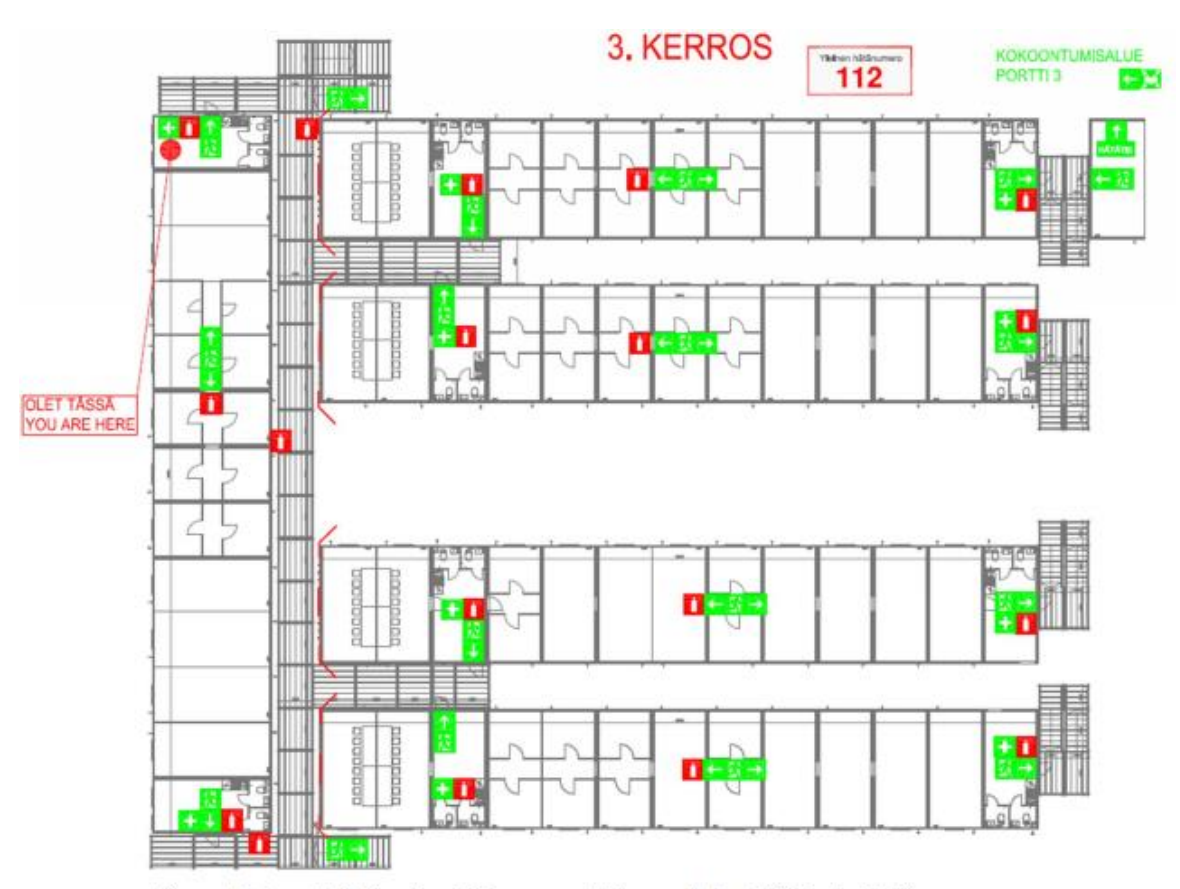
Kuva: Esimerkkipiirustus työmaaparakkien poistumisjärjestelyistä

If the number of occupants on a floor exceeds 20, two separate escape routes must be arranged from each floor. Escape routes must be located such that there are no cul-de-sacs more than ten (10) metres in length. Escape routes must always be indicated and equipped with illuminated signs. The stairs of escape routes must be made of non-combustible material.