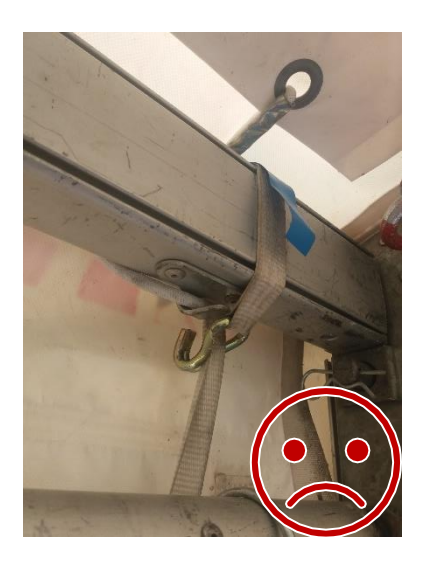
The strap will shear as it tightens.