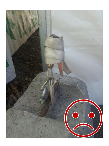
A shackle is present but not used for fastening. The hook will come loose as the structure flexes.

The Finnish Safety and 29 505 2000 Chemicals Agency