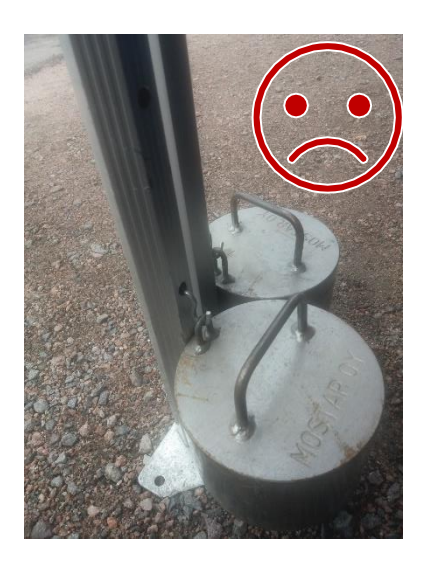
The steel hook is unlocked. Steel will cut aluminium, making the fastening ineffective.