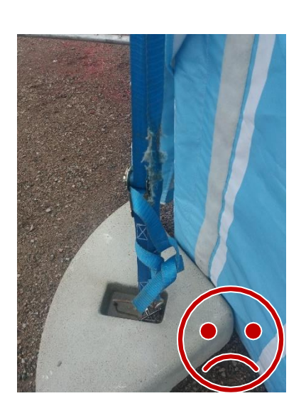
The strap has worn down.