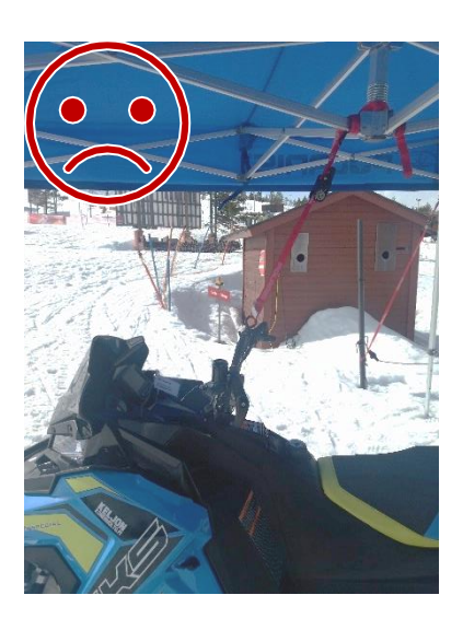
The S hook will come loose as wind moves the tent.