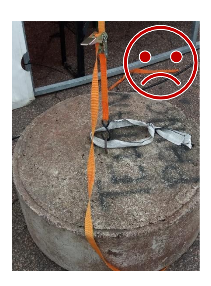
The S hook will come loose as wind moves the structure. The fastening is not locked to the mounting point.

The Finnish Safety and 29 505 2000 Chemicals Agency